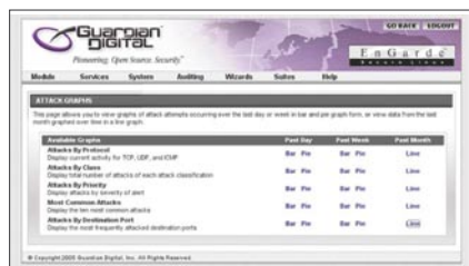
Figure 2. Attack graphic

With the EnGarde WebTool, setting up your firewall and firewall rule set is as easy as 1.2.3 Creating port forward rule sets can be done and maintained in a matter of seconds, obviously an understanding of ports is needed when using the Web Tool firewall setup.